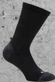
JALAS® 8210 Mediumweight and half terry cloth sock