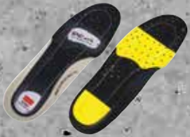
JALAS® 8202 FX2 Supreme insole

Extend the life of your favourite JALAS® safety shoes by periodically replacing the insoles. All JALAS® quality insoles are available as replacements and are identical to the ones that come with a new pair of JALAS® safety shoes.