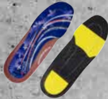
JALAS® 8244 FX2 Winter insole

Get the most out of your JALAS® HEAVY DUTY safety shoes by pairing them with a pair of premium JALAS® socks. Socks recommended for JALAS® HEAVY DUTY shoes: