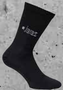
JALAS® 8208 Lightweight and breathable sock

Get the most out of your JALAS® HEAVY DUTY safety shoes by pairing them with a pair of premium JALAS® socks. Socks recommended for JALAS® HEAVY DUTY shoes: